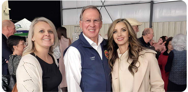
TCEA STAFF WITH SENATOR FERRELL HAILE