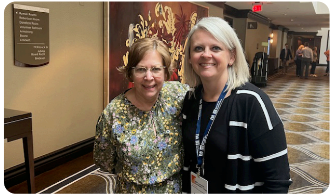
2024 TVA ECONOMIC DEVELOPERS FORUM