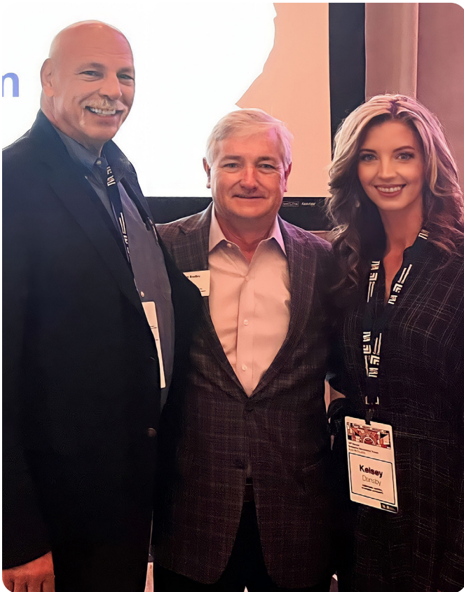
2023 TVA ECONOMIC DEVELOPERS FORUM