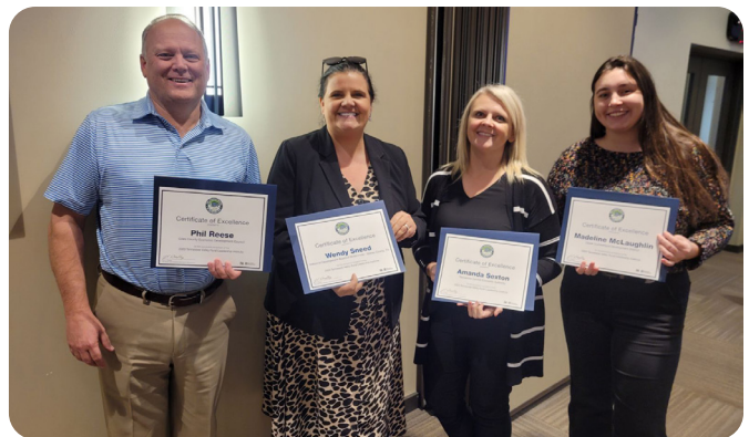
TVA RURAL LEADERSHIP INSTITUTE