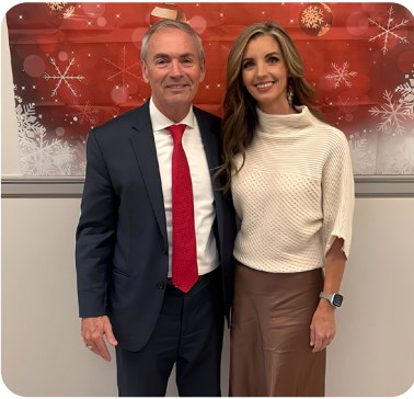
WILSON COUNTY MAYOR HUTTO'S OPEN HOUSE