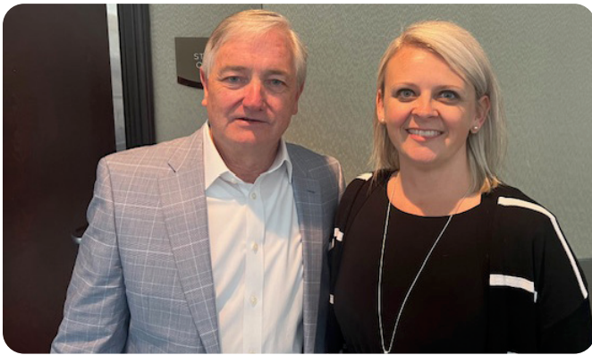
2024 TVA ECONOMIC DEVELOPERS FORUM