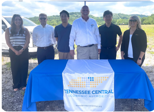
PROJECT RECOVERY SITE VISIT