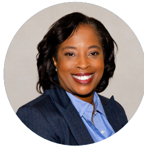
Senate Appointee Mae Wright