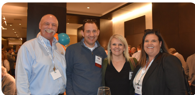
TEDC FALL CONFERENCE