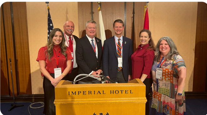
TEP SEUS JAPAN