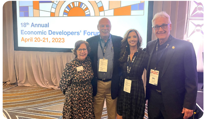
2023 TVA ECONOMIC DEVELOPERS FORUM