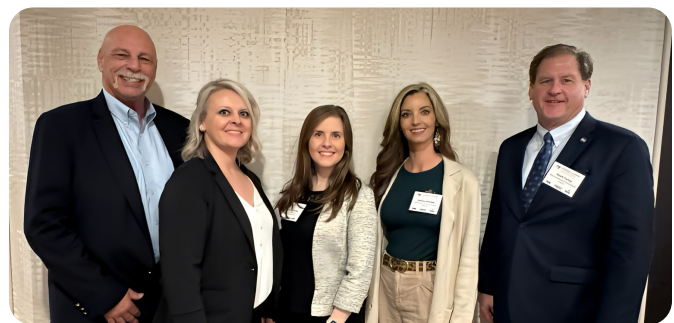
TEDC DAY ON THE HILL