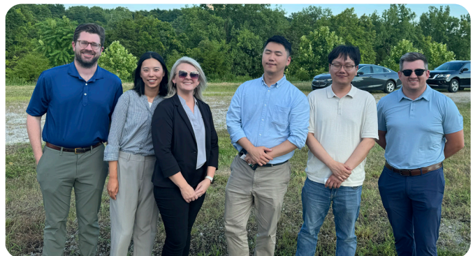
PROJECT TOPAZ SITE VISIT