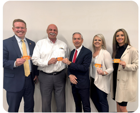
WILSON COUNTY STATE OF ADDRESS