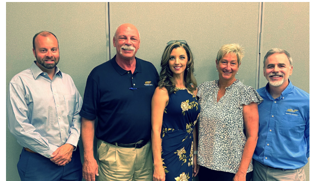
TN ECD & TCEA STAFF