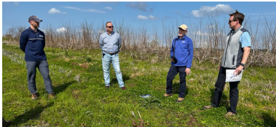
SMITH COUNTY FAM TOUR