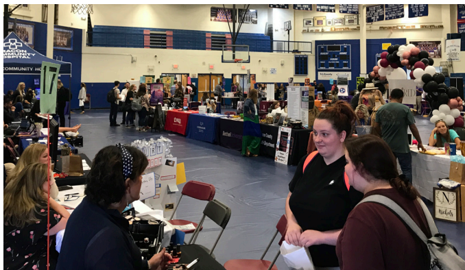
MACON COUNTY JOB FAIR