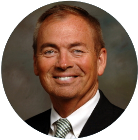
Wilson County Mayor Randall Hutto