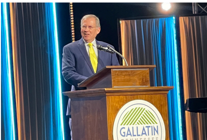
GOVERNOR LEE'S GOOD MORNING GALLATIN