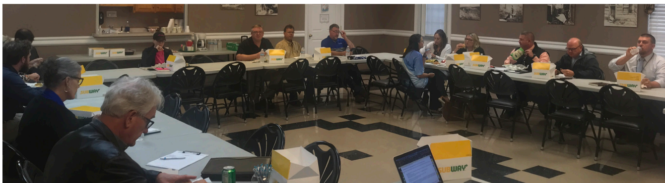
SMITH COUNTY INDUSTRY AND EDUCATION ALIGNMENT