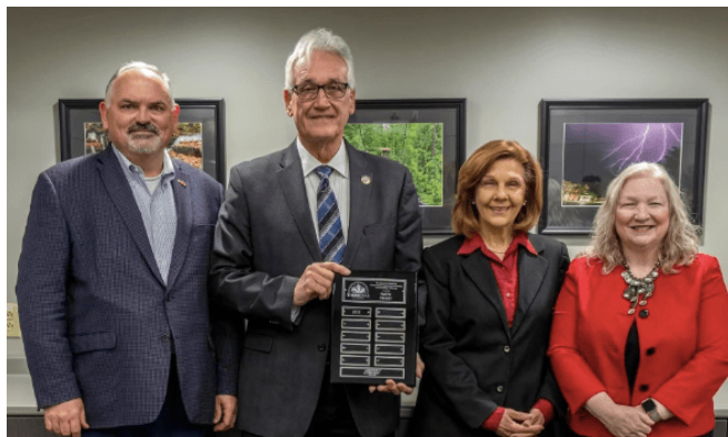
SMITH COUNTY RECEIVES GOVERNOR'S THREE STAR AWARD