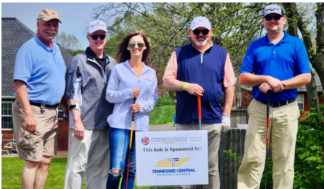
TCAT GOLD TOURNAMENT