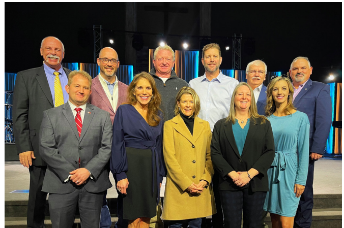
GOVERNOR LEE'S GOOD MORNING GALLATIN