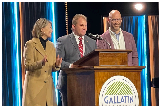
GOVERNOR LEE'S GOOD MORNING GALLATIN