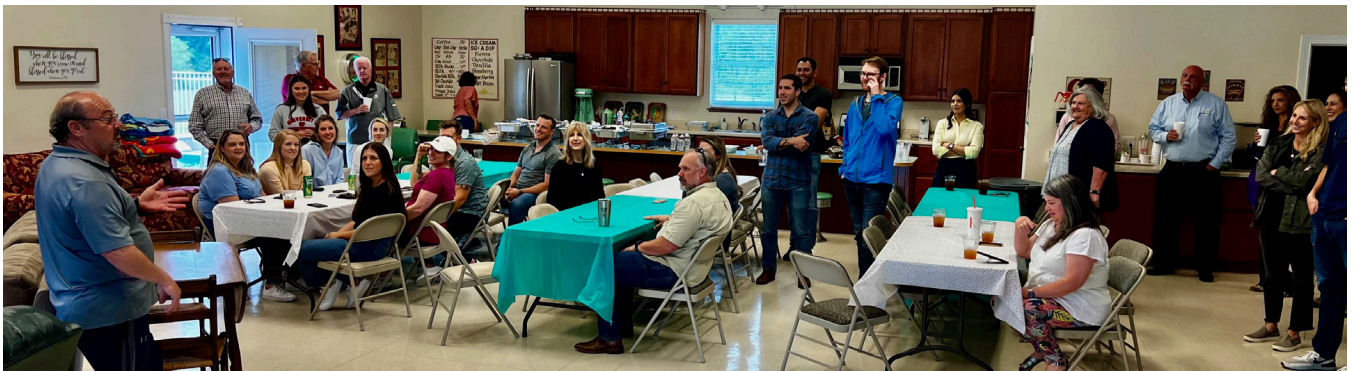
TN ECD BBQ