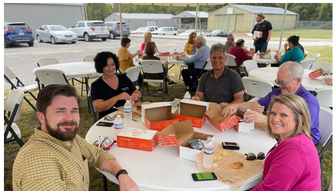
TCEA INDUSTRY APPRECIATION LUNCHEON