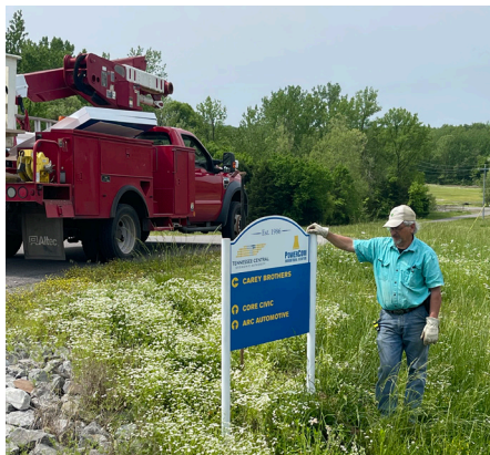
SIGNAGE UPGRADES IN POWERCOM