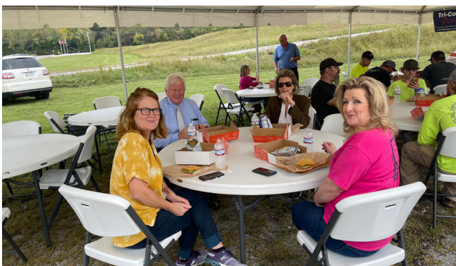
TCEA INDUSTRY APPRECIATION LUNCHEON