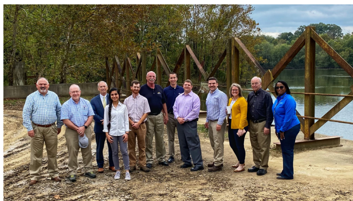
WORK SESSION POWERCOM SITE VISIT