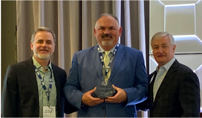
TVA RURAL CERTIFICATION AWARD SMITH COUNTY