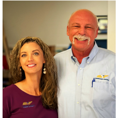
TN ECD BBQ