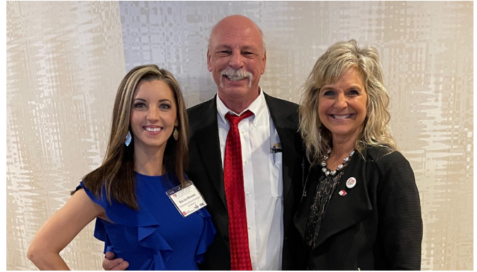
TEDC DAY ON THE HILL