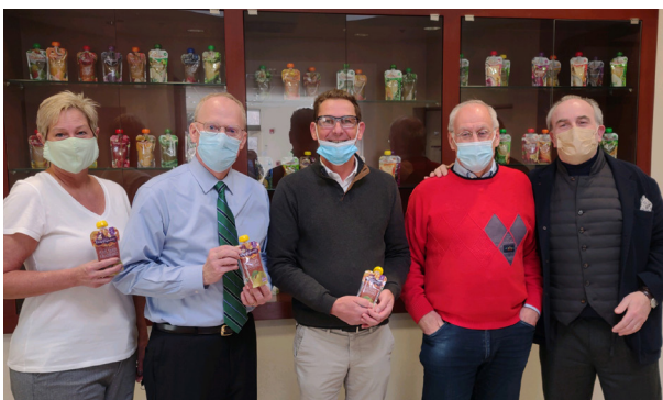
2022 BABY NOV CONGRESSMAN ROSE