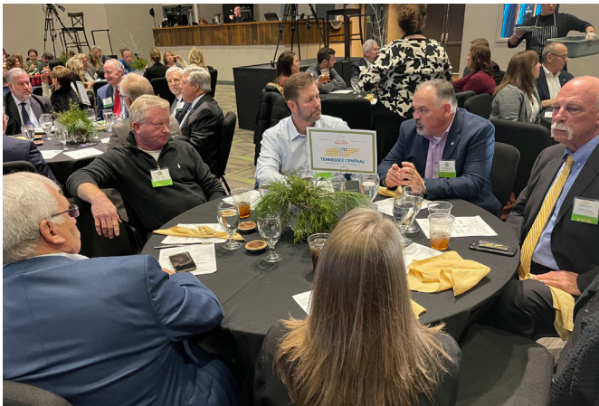
GOVERNOR LEE'S GOOD MORNING GALLATIN