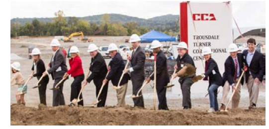
CCA Groundbreaking 2014