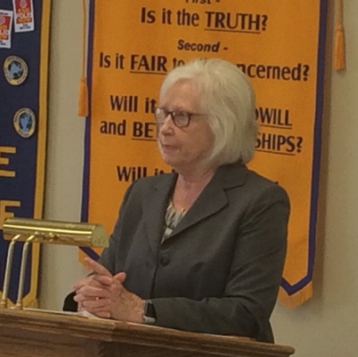
Macon County receives Legislative update from Senator Beavers