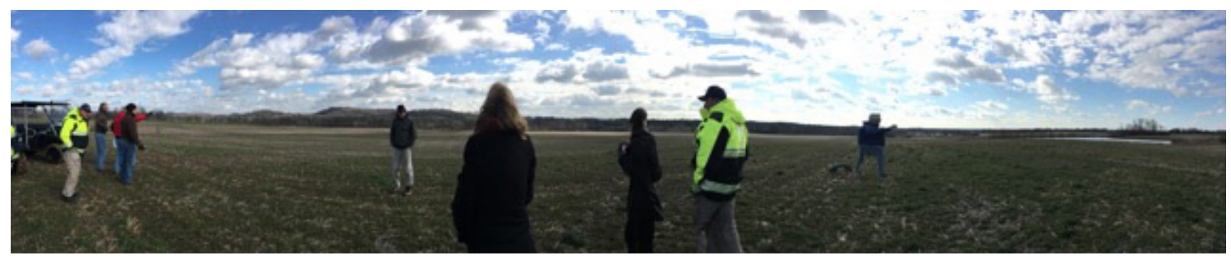
Tennessee Central assists Sumner County with PEP (Property Evaluation Program) preparations & visit from TNECD & Austin Consulting