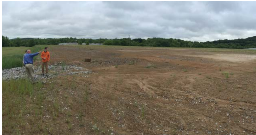
The 20+ Acre PowerCom site in Trousdale County is visited by TNECD & Austin Consulting for certification evaluation with the TN Select Site program