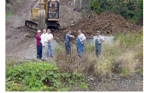
Infrastructure Development Begins