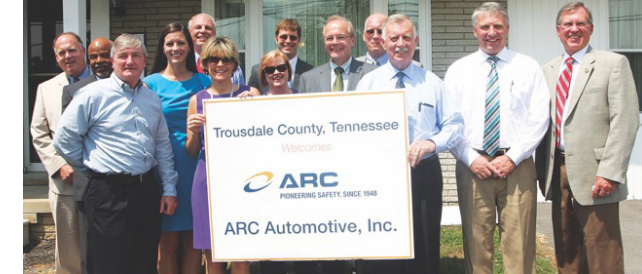
ARC Automotive 2014 announcement