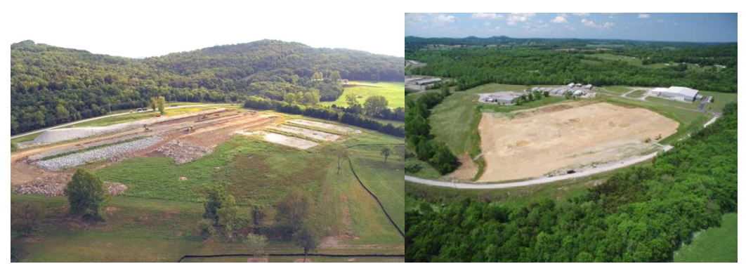
20+ Acre Shovel-Ready Site Before / After