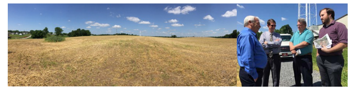
Tennessee Central assists Macon County with potential industrial park expansion plans & site visits with consultants.