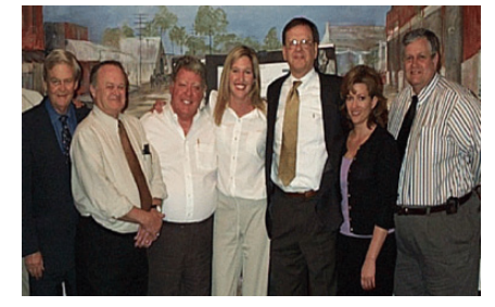
2001/2002 Executive Committee & Staff