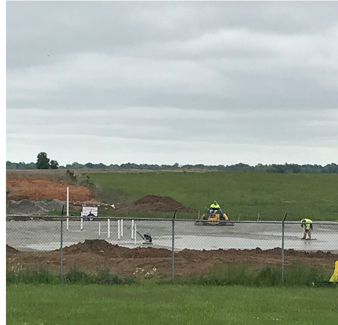
SAFARI HELICOPTERS BUILDING CONSTRUCTION MACON