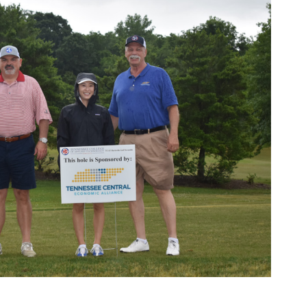
TCAT GOLF TOURNAMENT