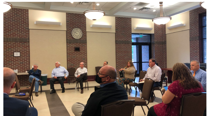
MACON COUNTY UCDD EDUCATION SESSION