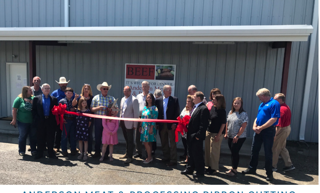
ANDERSON MEAT & PROCESSING RIBBON CUTTING