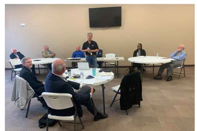
TCEA BOARD MEETING