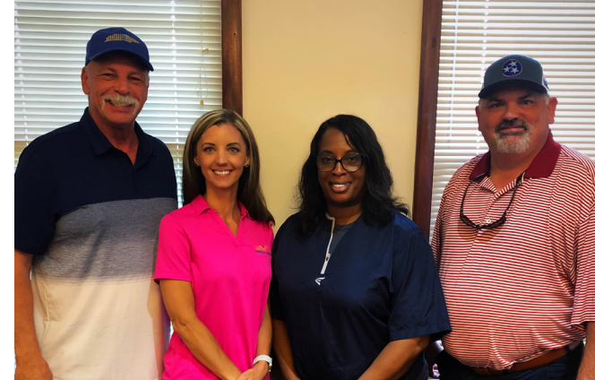
TCAT GOLF TOURNAMENT