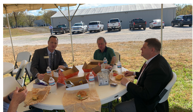
TROUSDALE COUNTY INDUSTRY APPRECIATION LUNCHEON TROUSDALE COUNTY INDUSTRY APPRECIATION LUNCHEON