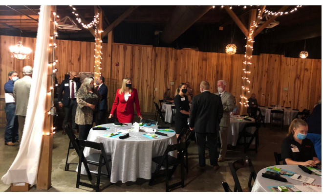
GALLATIN CHAMBER LUNCHEON