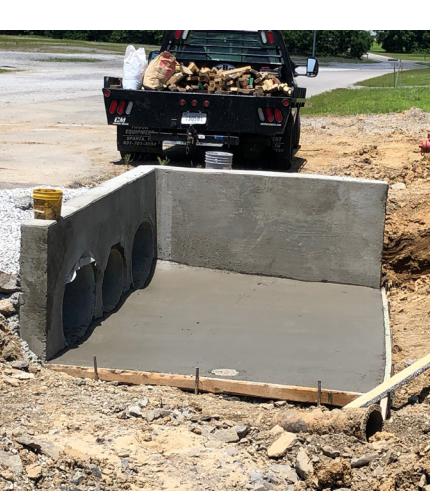
POWERCOM DRAINAGE IMPROVEMENTS POWERCOM DRAINAGE IMPROVEMENTS POWERCOM DRAINAGE IMPROVEMENTS