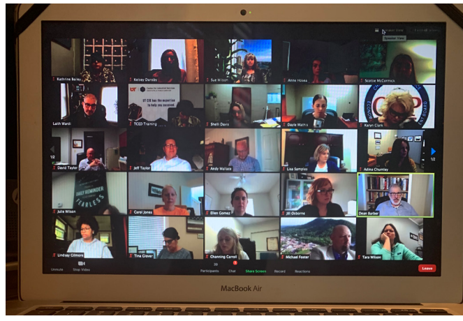
UT CENTER OF INDUSTRIAL SERVICES ONLINE/ZOOM TRAINING