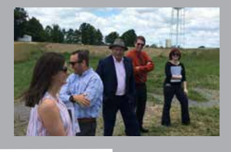
Macon County InvestPrep Site Visit