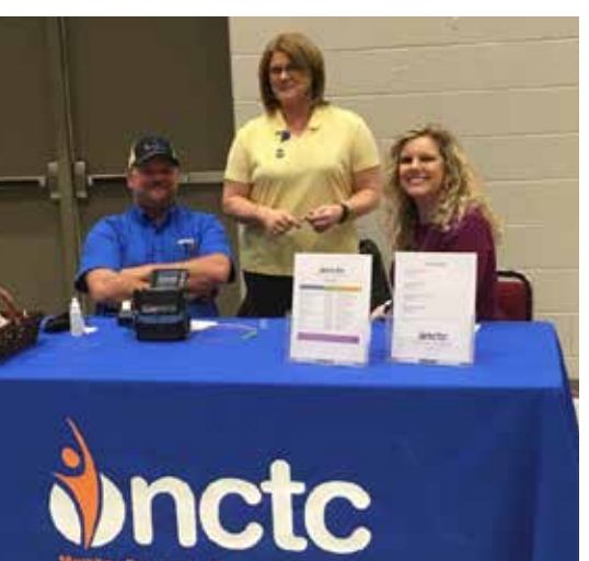
TCHS Career Day