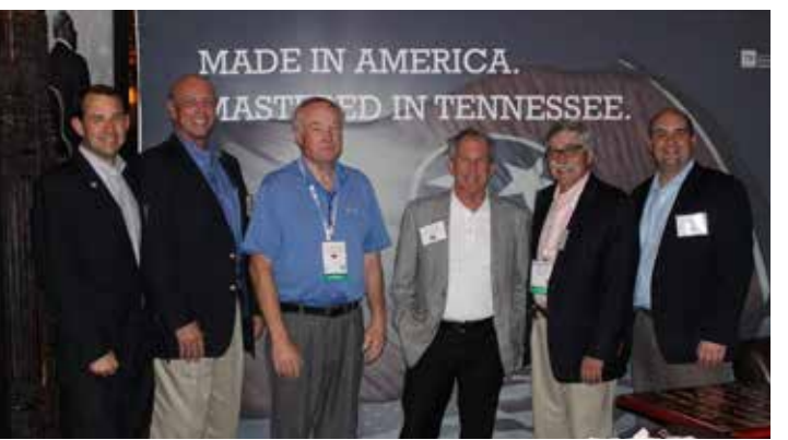
Coverings 2017 TEP Reception