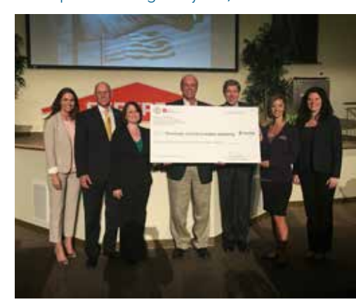
ECD Grant for Village 1 Sewer Improvements