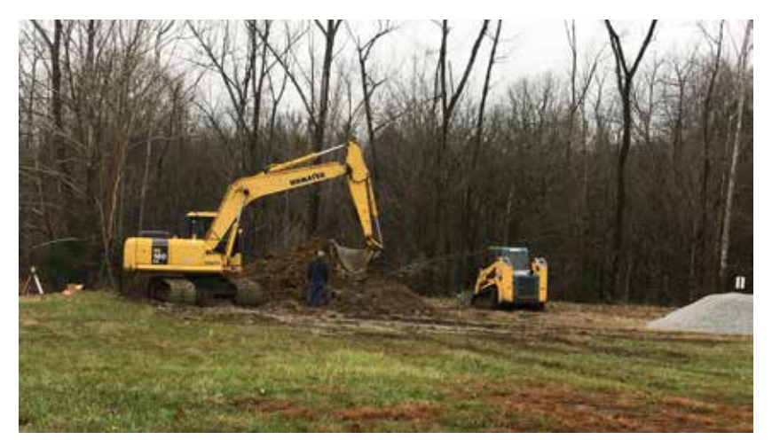
Village 1 Drainage Improvements