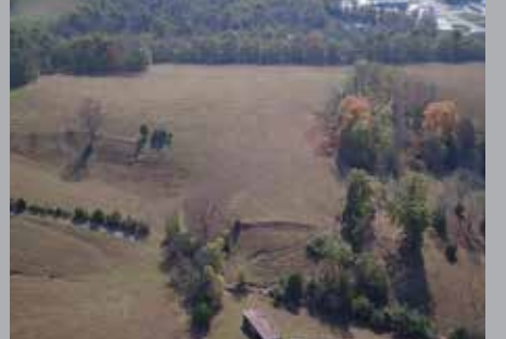
Smith County InvestPrep Site Visit