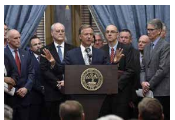
Mayor Nesbitt and County Executive Holt working with Governor Haslam